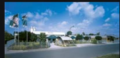
Silikal production and administration in Mainhausen, near Frankfurt/Main, Germany.

Contact us. We would be pleased to go into detail with you – at no cost or obligation to you, of course.