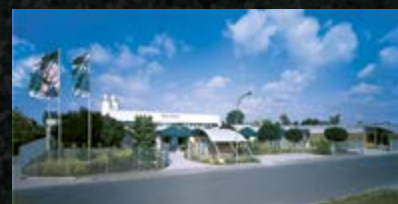
Silikal production and administration in Mainhausen, near Frankfurt/Main, Germany.

Contact us. We would be pleased to go into detail with you – at no cost or obligation to you, of course.