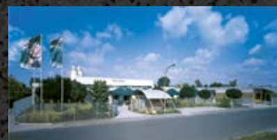
Silikal production and administration in Mainhausen, near Frankfurt/Main, Germany.

Contact us. We would be pleased to go into detail with you – at no cost or obligation to you, of course.