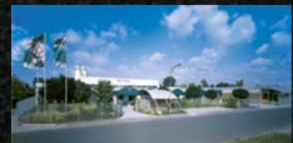
Silikal production and administration in Mainhausen, near Frankfurt/Main, Germany.

Contact us. We would be pleased to go into detail with you – at no cost or obligation to you, of course.