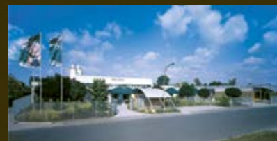
Silikal production and administration in Mainhausen, near Frankfurt/Main, Germany.

Contact us. We would be pleased to go into detail with you – at no cost or obligation to you, of course.