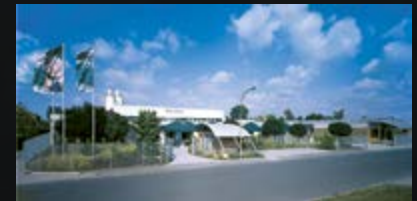
Silikal production and administration in Mainhausen, near Frankfurt/Main, Germany.

Contact us. We would be pleased to go into detail with you – at no cost or obligation to you, of course.